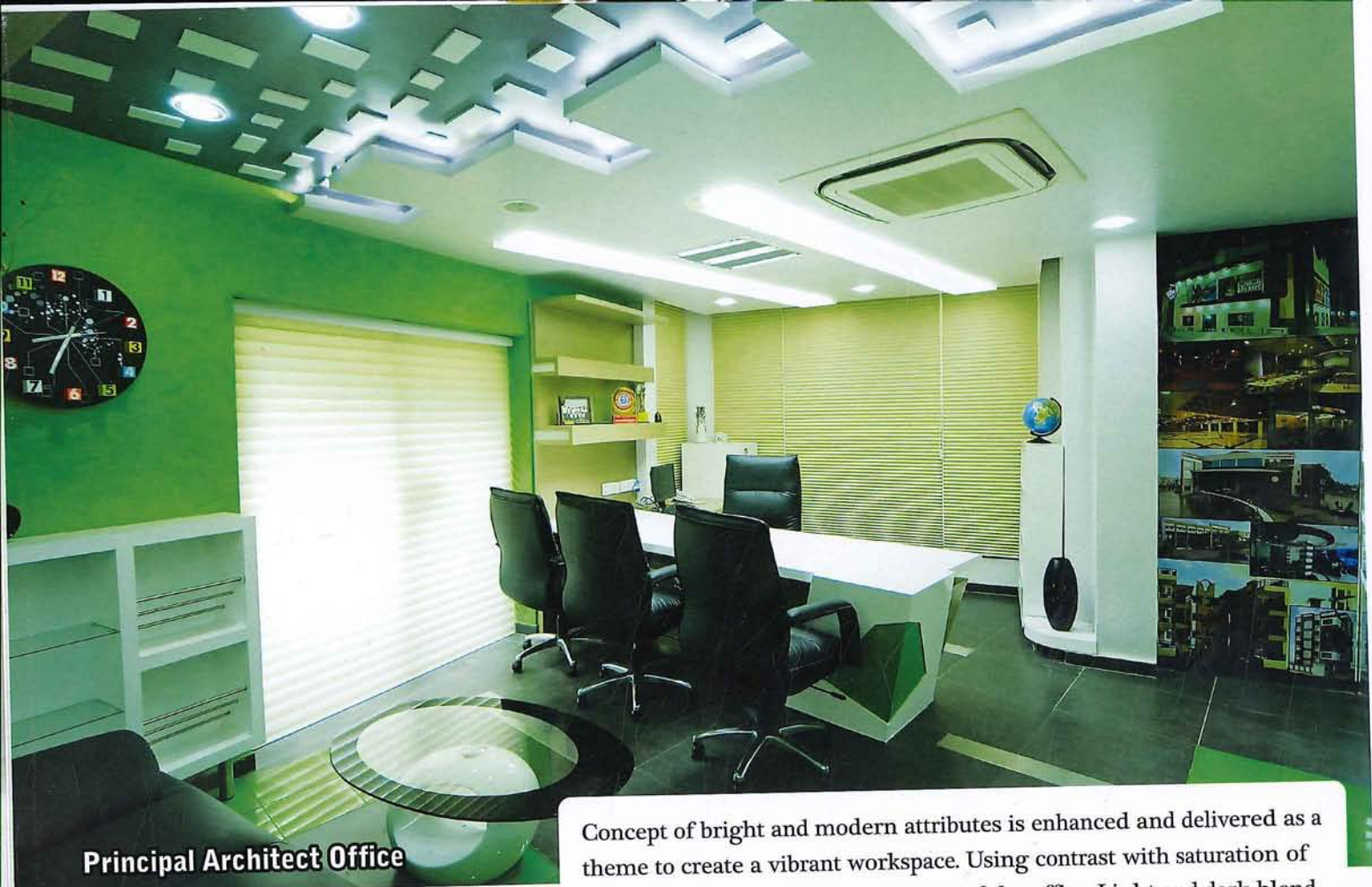
Principal Architect Office

Concept of bright and modern attributes is enhanced and delivered as a theme to create a vibrant workspace. Using contrast with saturation of colors develops a unique impression of the office. Light and dark blend of furniture, innovative skyline ceiling, bright wall color and soothing floor tiles are combined to produce contemporary architectural environment where principal architect interact with clients.